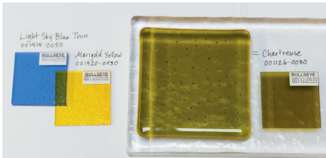
TOP: Light Sky Blue Thin 001414-0050 BASE: Marigold Yellow 001320-0030. Tile shown elevated on a Clear billet for light transmission.