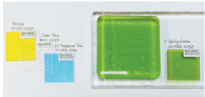
TOP: Yellow 001120-0030 MIDDLE: Clear Thin 001101-0050 * BASE: Light Turquoise Blue Thin 001416-0050. Tile shown elevated on a Clear billet for light transmission.