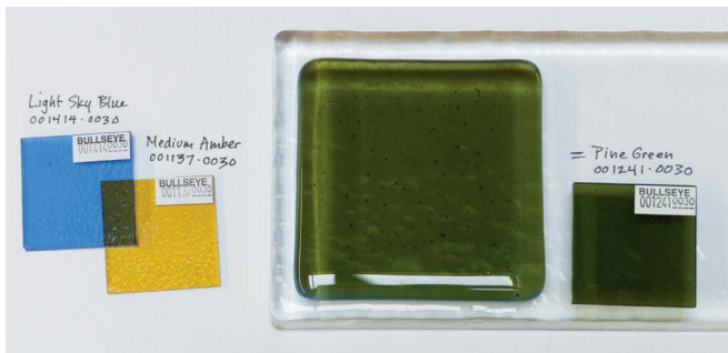
TOP: Light Sky Blue 001414-0030 BASE: Medium Amber 001137-0030. Tile shown elevated on a Clear billet for light transmission.