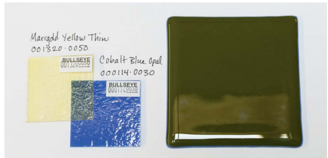
TOP: Marigold Yellow Thin 001320-0050 BASE: Cobalt Blue Opal 000114-0030 MIDDLE: Clear Thin 001101-0050 *