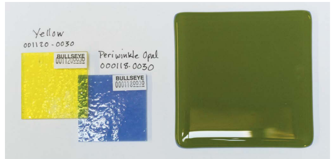
TOP: Yellow 001120-0030 BASE: Periwinkle Opal 000118-0030 MIDDLE: Clear Thin 001101-0050 *