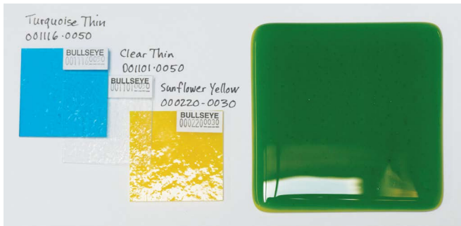
TOP: Turquoise Blue Thin 001116-0050 MIDDLE: Clear Thin 001101-0050 * BASE: Sunflower Yellow Opal 000220-0030.