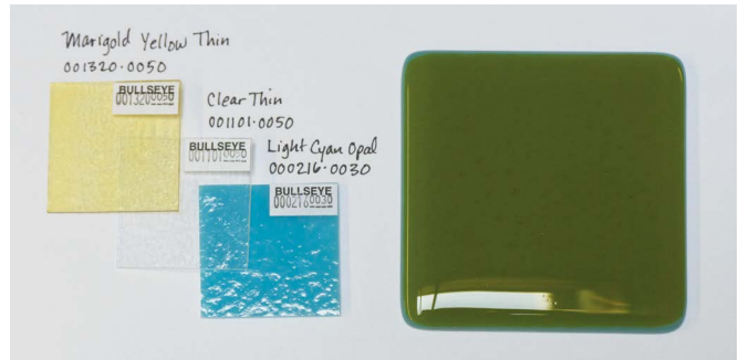
TOP: Marigold Yellow Thin 001320-0050 MIDDLE: Clear Thin 001101-0050 * BASE: Light Cyan Opal 000216-0030.