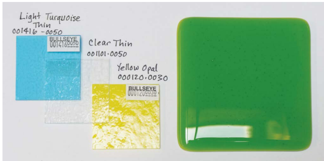
TOP: Light Turquoise Blue Thin 001416-0050 MIDDLE: Clear Thin 001101-0050 * BASE: Canary Yellow Opal 000120-0030.

How to make green from other colors of Bullseye glass.