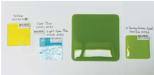
TOP: Yellow 001120-0030 MIDDLE: Clear Thin 001101-0050 * BASE: Light Cyan Opal Thin 000216-0050.