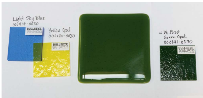
TOP: Light Sky Blue 001414-0030 BASE: Canary Yellow Opal 000120-0030 MIDDLE: Clear Thin 001101-0050 *

*Requires Clear Thin between colors to prevent a dark color reaction.