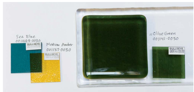
TOP: Sea Blue 001444-0030 BASE: Medium Amber 001137-0030. Tile shown elevated on a Clear billet for light transmission.