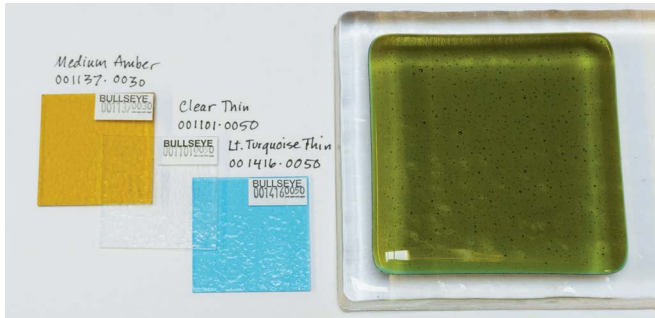
TOP: Medium Amber 001137-0030 MIDDLE: Clear Thin 001101-0050 * BASE: Light Turquoise Blue Thin 001416-0050. Tile shown elevated on a Clear billet for light transmission.