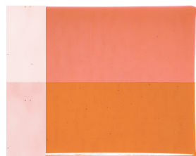
Sunset Coral 001305-0030, -0050 ● unstruck (left) and struck (right)