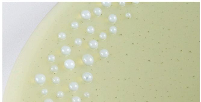
Frit balls made with Opaline Striker coarse frit (000403-0003). (Top and middle) Tack fused together, then slumped. (Bottom) Tack fused to a fully fused plate, then slumped.