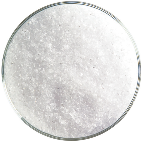
Opaline Striker medium frit (000403-0002)